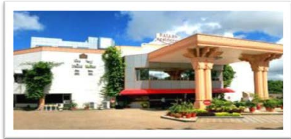
Hotel Palash Residency