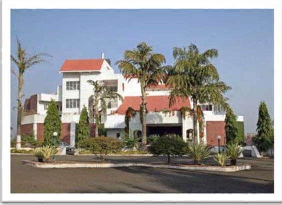
Hotel Lake View Ashoka