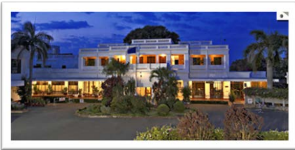
Hotel Jehan Numa Palace