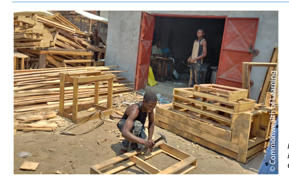
Informal furtniture cooperative in Zambia, supported by the Commonwealth of Learning