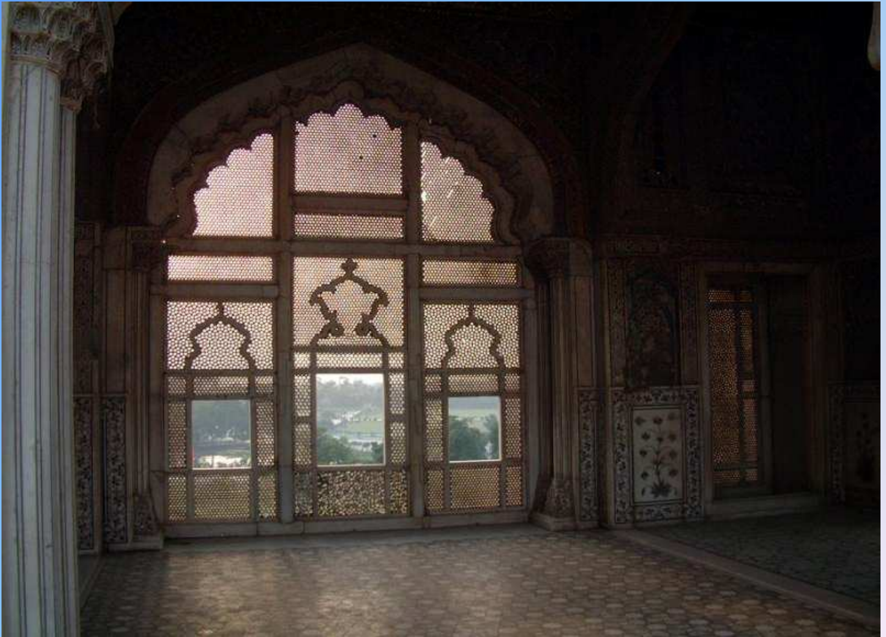
LAHORE FORT (1566 AD)