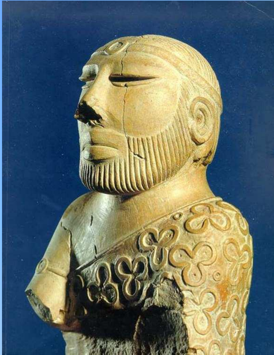
ARCHAEOLOGICAL RUINS AT MOENJODARO (2600 BC)