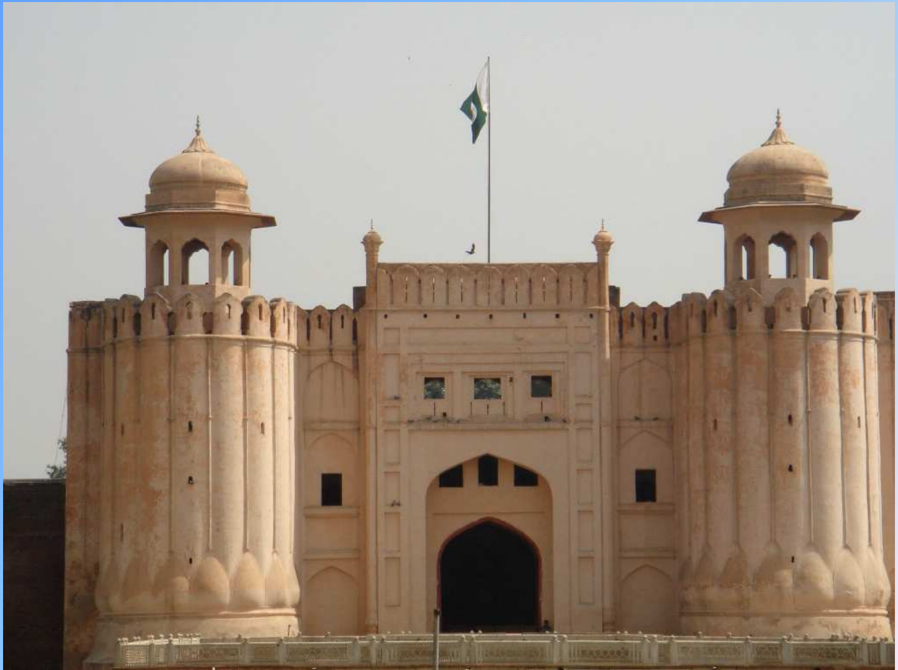
LAHORE FORT (1566 AD)