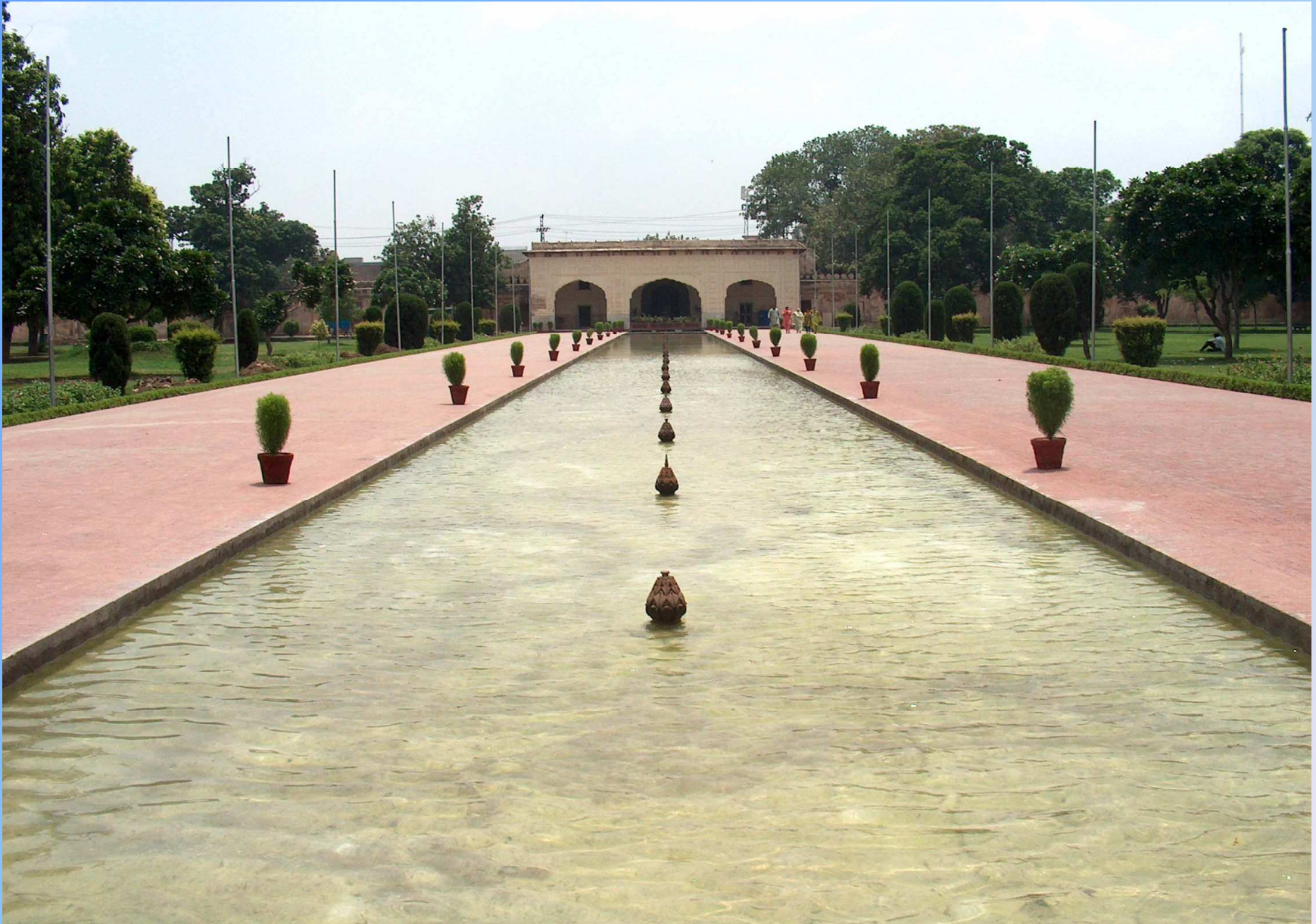
SHALIMAR GARDENS, LAHORE (1641 A.D)