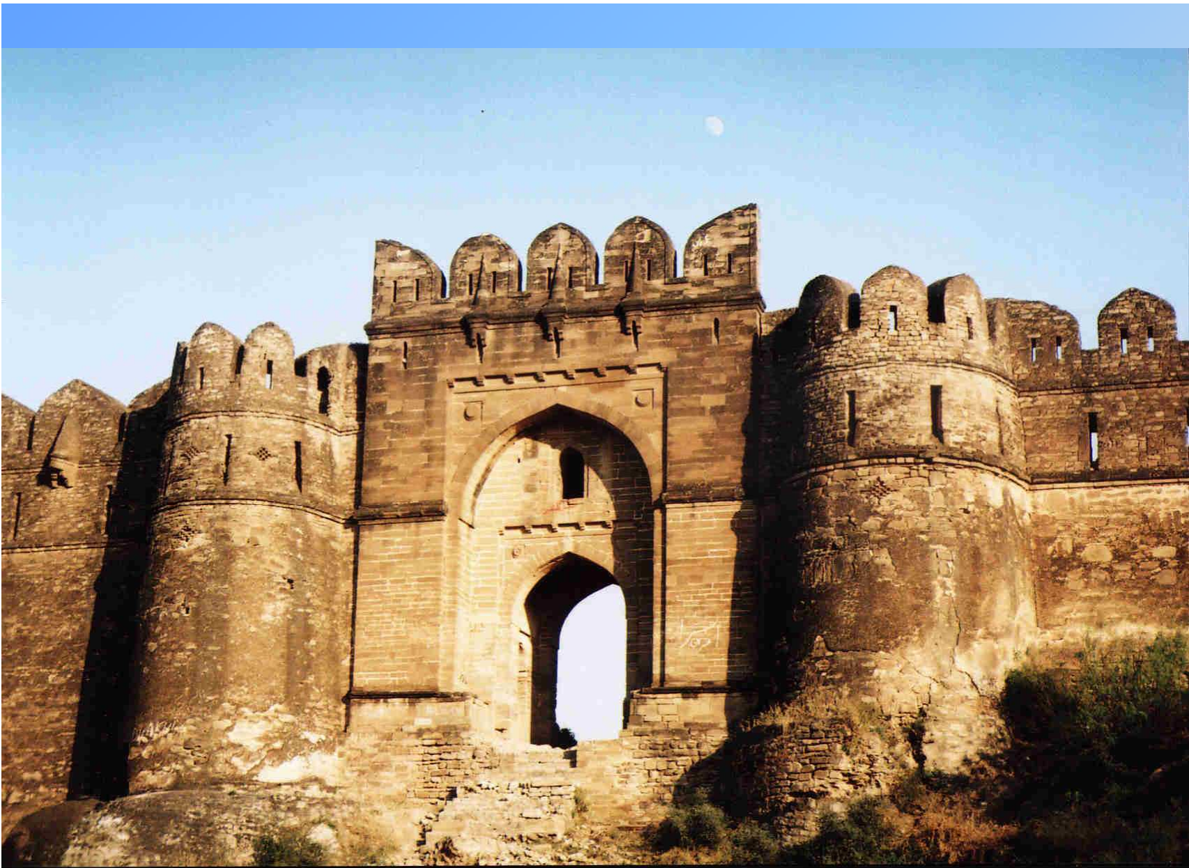
The Kabuli Gate.