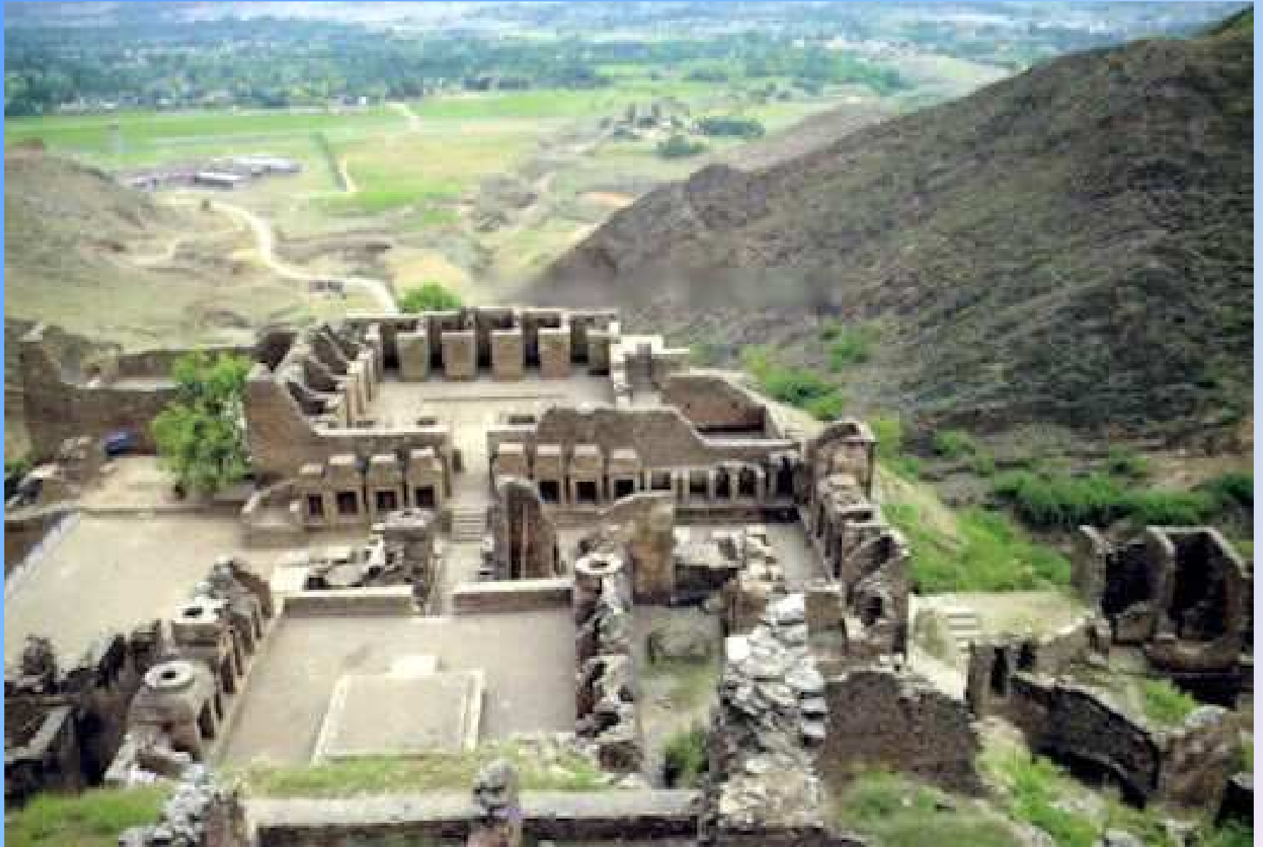
TAKHT BAHİ , MARDAN (1ST CENTURY BCE)